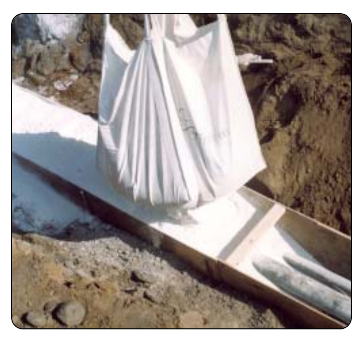
Typical Trench Forming

The function of DriTherm® is to provide both pipe insulation and corrosion protection in a field applied system. DriTherm® is installed directly around piping to form a dense, closed cell barrier, between piping and the surrounding soil. Once installed to specified dimensions, the product self compacts upon backfill to form a strong (12,000 PSF) block of cohesively bonded particles that prevent air, water, moisture passage to the carrier piping.