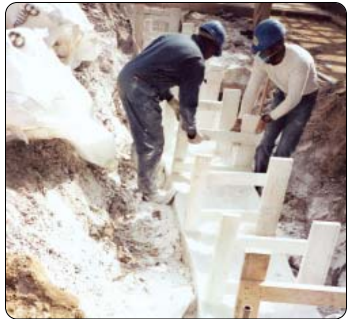
Removal of Temporary Spacers