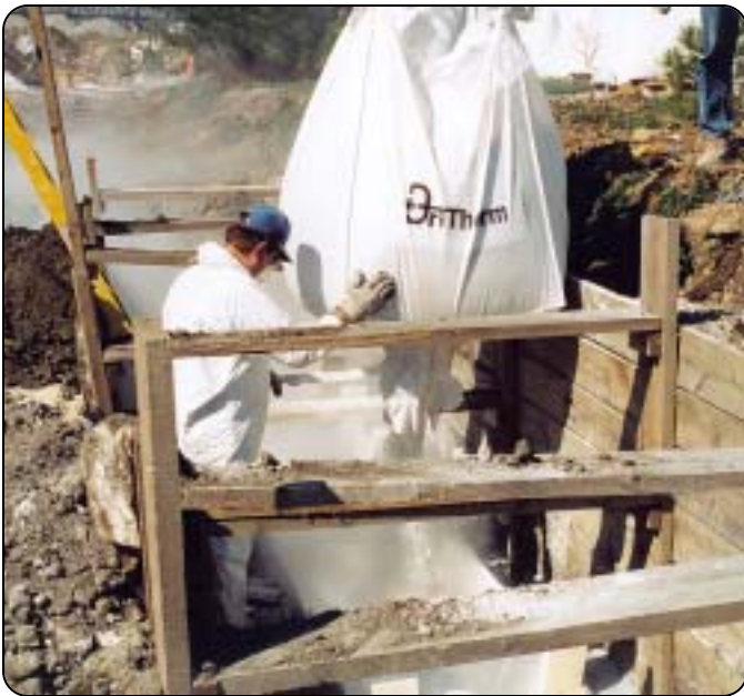
Packaged in Super Sacks

DriTherm® is manufactured and stock maintained at (6) facilities in the United States, located in California, Georgia, Illinois, Iowa, Massachusetts, and Texas. In Canada, DriTherm® is warehoused and distributed in Montreal, Ottawa, and Winnipeg. Enough DriTherm® to insulate and protect several hundred feet of underground piping can be shipped to arrive anywhere in the continental United States within (24) hours.