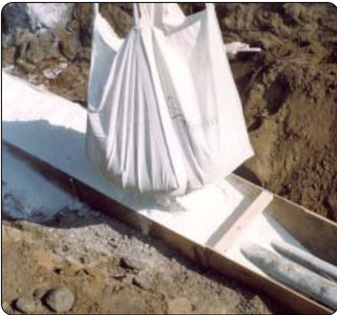
Typical Trench Forming

The function of DriTherm® is to provide both pipe insulation and corrosion protection in a field applied system. DriTherm® is installed directly around piping to form a dense, closed cell barrier, between piping and the surrounding soil. Once installed to specified dimensions, the product self compacts upon backfill to form a strong (12,000 PSF) block of cohesively bonded particles that prevent air, water, moisture passage to the carrier piping.