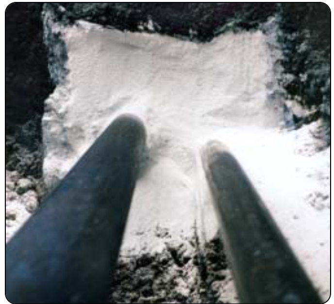
14 Year Old Installation